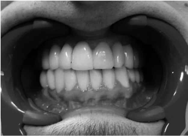
Figure 5. Clinical situation after 5 years