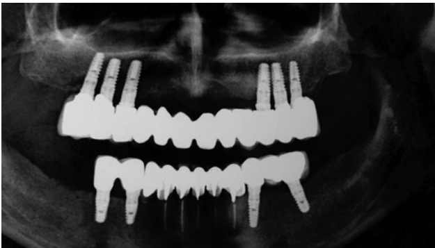
Figure 6. Panoramic radiography after 5 years