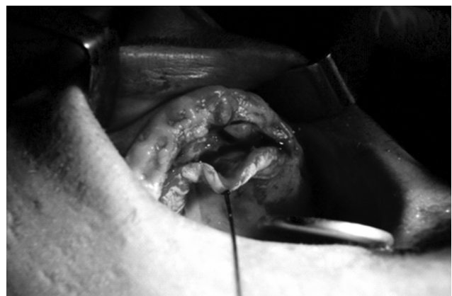
Figure 2. Surgical extraction of impacted canines

Multiple extractions of all teeth in the upper jaw took place in the first phase of patient rehabilitation. In the second phase, an endodontic-surgical treatment of lower frontal teeth was done, with simultaneous extraction of remaining lower teeth. The third stage involved surgical extraction of upper impacted canines with augmentation of bone defects in order to create favourable conditions for the implantation (Figure 2). Bone augmentation was performed by bone substitute (Bio-Oss ® ) and bio-resorptive membranes (Bio-Gide ® ). After a period of healing extraction wounds for six months and analysis of the CBCT image, the next stage encompassed the implant-prosthetic treatment.