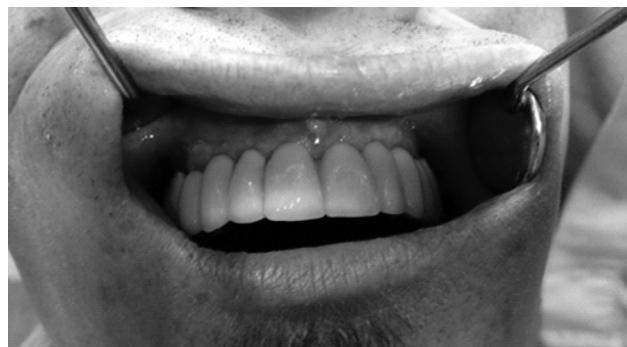
Figure 4. Definitively cemented prosthetic work