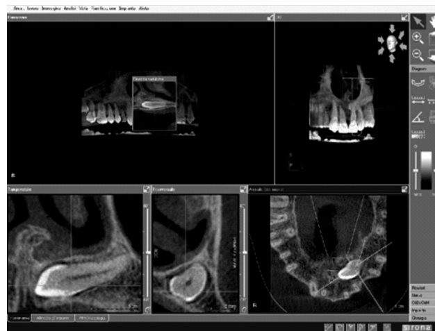
Figure 1. The software has 5 display windows