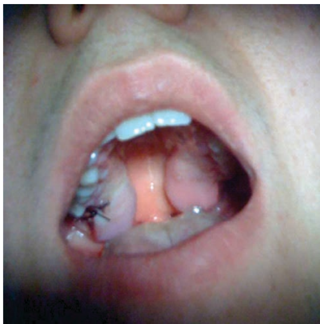
Figure 1. Intraoral myeloid sarcoma with bilateral palatal involvement in the first and second upper molar area

The intraoral clinical examination revealed two painless sessile, soft in palpation, masses, 2cm in maximum dimension, with identical clinical appearance and location, with no colour changes. Furthermore, there was obvious palatal protrusion of both masses in the first and second molar area (Fig. 1). There were no odontogenic sources or other associated intraoral lesions. Plain radiographs and a computed tomography scan failed to show underlying bone erosion. In addition, the patient performed full blood investigations two months ago, which were ranged within the normal values.