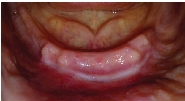
Figure 6. 4 weeks after surgery the healing was completed. Sufficient vestibular depth with a noticeably delicate scar