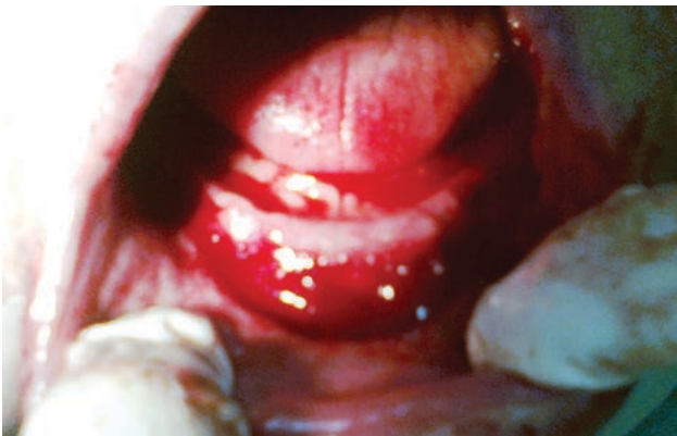
Figure 4. Surgery in progress. Deeper tissue layers exposed