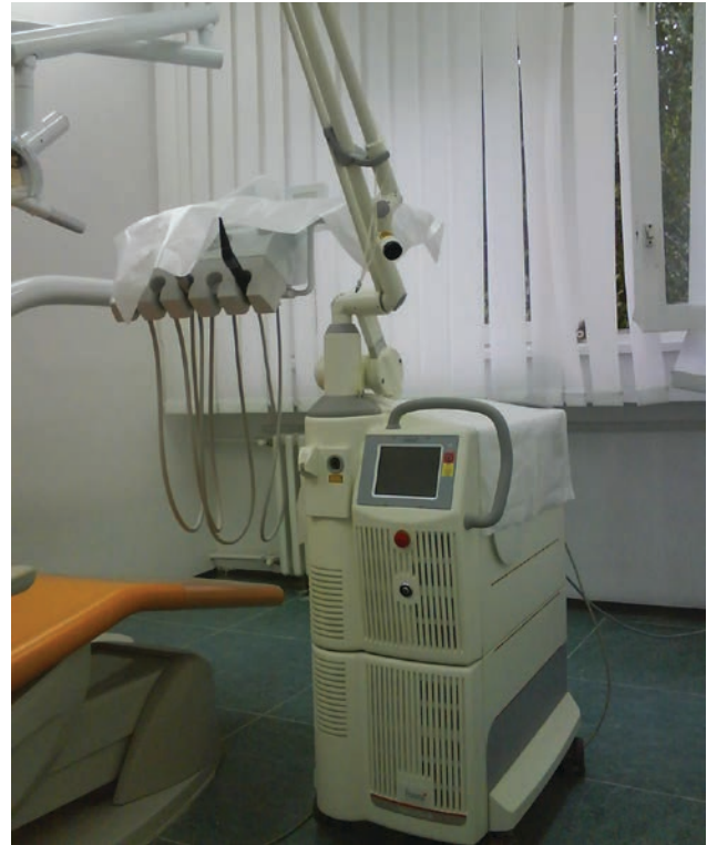
Figure 2. Fotona Fidelis III laser

Mandibular anterior vestibuloplasty was performed with Er:YAG Fotona Fidelis III (Fig. 2), a non-contact hand piece R02, short pulse mode (SP), pulse energy of 200 mj, and frequency of 2 Hz, without water and air spray (Tab. 1).