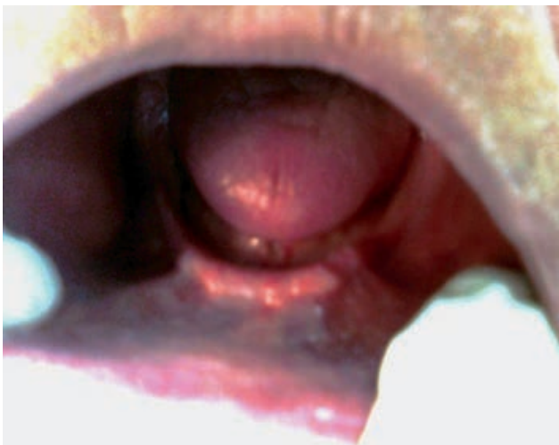
Figure 1. Preoperative view of the shallow mandibular anterior vestibule

A 69-year-old patient was referred to the University Department of oral surgery after several previous unsuccessful attempts to stabilize his lower denture. The intraoral assessment revealed complete mandibular edentulism and a shallow vestibule with sufficient bone height in the anterior region (Fig. 1). Since the patient's financial resources precluded dental implants, mandible anterior vestibuloplasty was planned to deepen the vestibule thus increasing the anatomic basis for prosthetic rehabilitation.